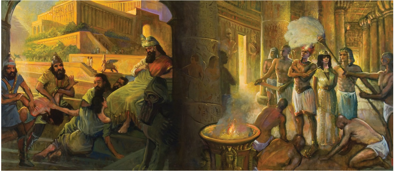
This panel is in the Supreme Court of Ohio's Rule of Law Gallery. The scene on the left presents Hammurabi (1795-1750 B.C.), the Babylonian king to whom the first written Code of Law is attributed. The scene on the right depicts the Reign of Ramses II, the Egyptian pharaoh credited with the earliest-known peace treaty.

The story of this court begins with the founding of Ohio. When early settlers arrived in Marietta on April 7, 1788, one of their first actions was to lay out a code of simple laws for governing their new home. They understood that laws and the courts that interpret and apply them are the very foundation of a civilized society.