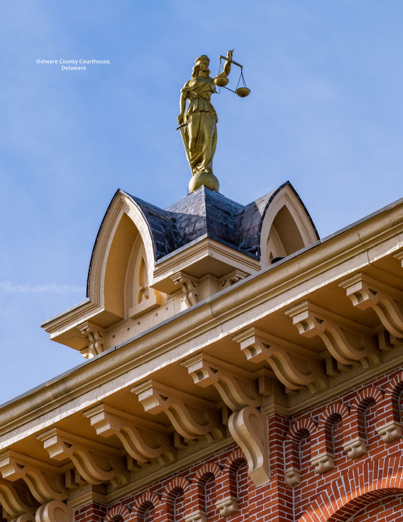
Delaware County Courthouse, Delaware