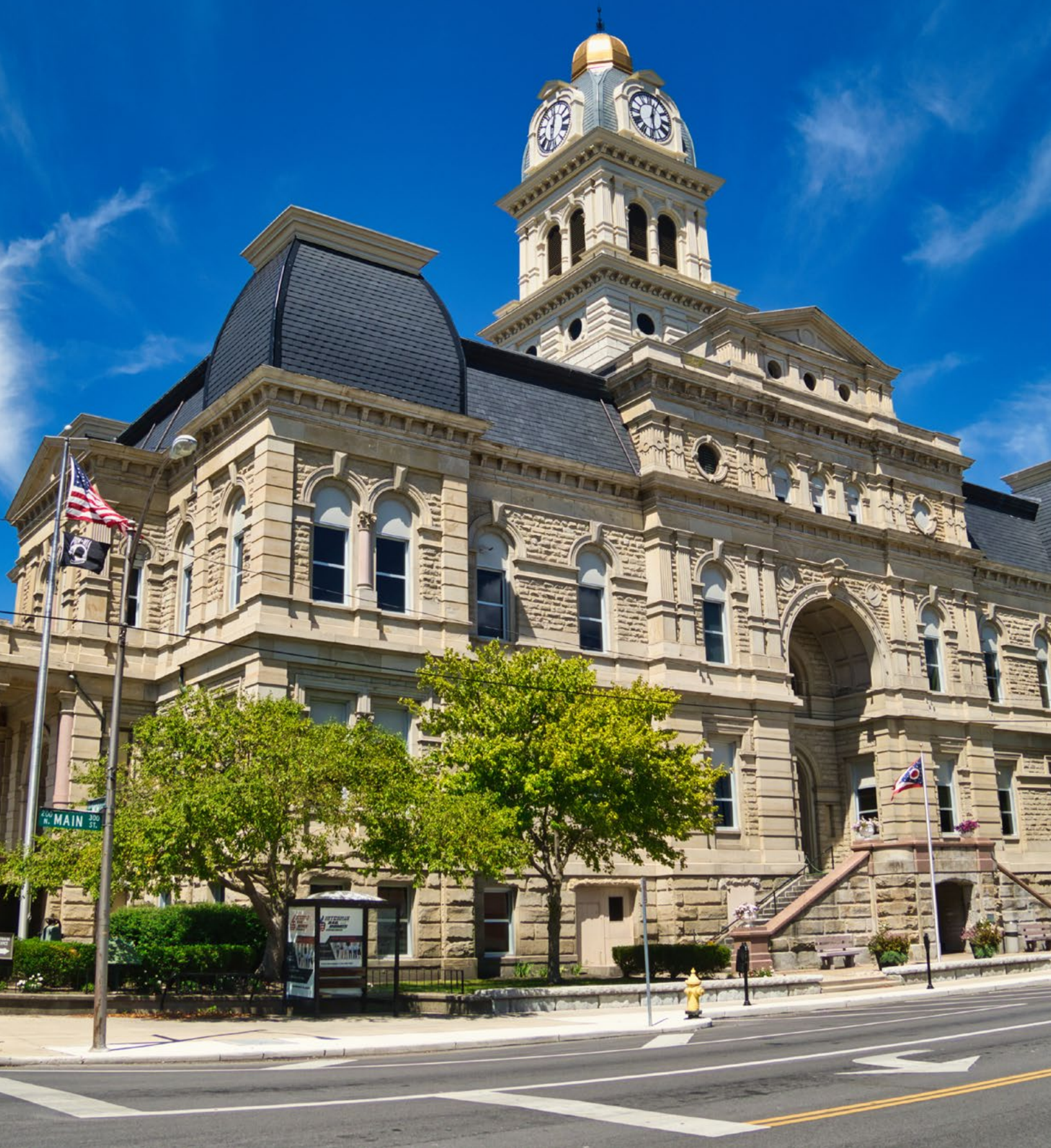
Allen County Courthouse, Lima