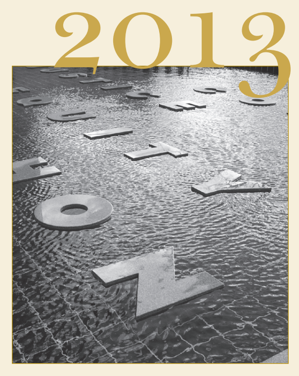
Attorney Services Fund Annual Report