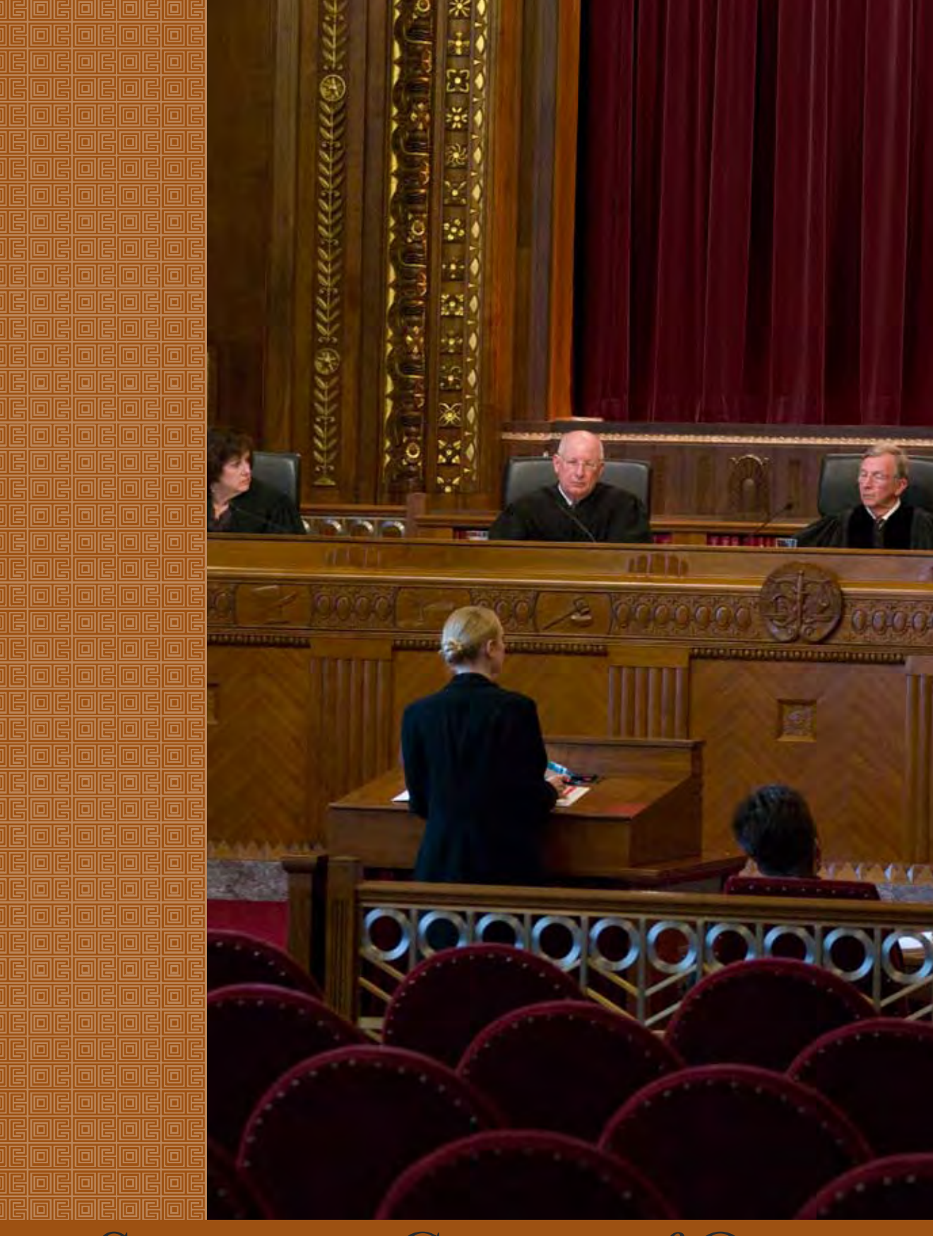
THE SUPREME COURT of OHIO SELECTED OPINION SUMMARIES 2008