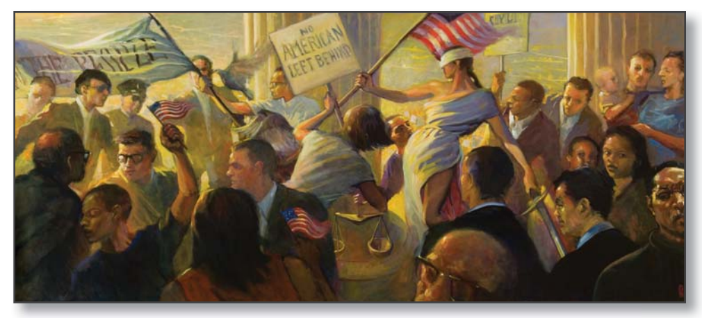
Lady Justice Leading the People, 2005, oil on canvas.

The final painting in the series is Anderson's portrait of modern times, from the Civil Rights movement of the 1960s to the present day.