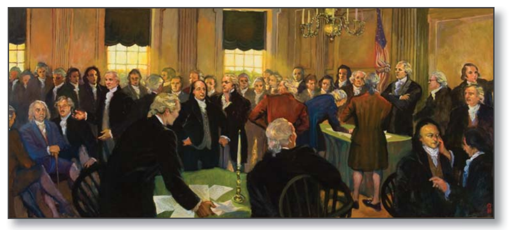
Signing of the Constitution, 2005, oil on canvas.

In the fifth painting, the Founding Fathers gather for a momentous occasion. The Constitutional Convention concluded Sept. 17, 1787, and the oldest codified, written, national Constitution was signed by delegates from the 13 American states. The U.S. Constitution officially went into effect in 1789, and has remained a model for nations throughout the world. The document, considered "the supreme law of the land," designates that powers are "separate and distinct" for each of the three branches of government so that a balance of power is achieved through a series of careful checks and balances.