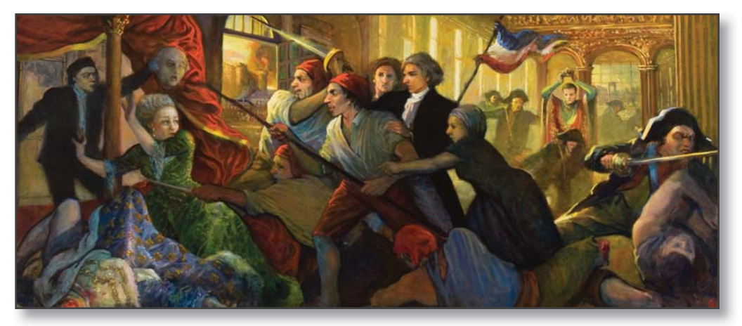
Dethroning the Monarchy, 2005, oil on canvas.