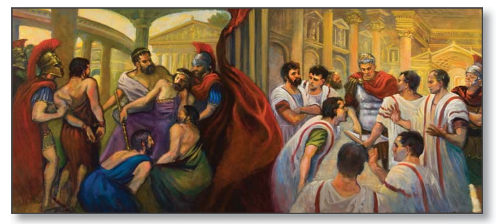
Draco, Coder of Law, and the Twelve Tables of Roman Law, 2005, oil on canvas.

The second painting depicts ancient Greece, where Draco, as "archon eponymous," was the first to codify Athenian laws. Draco's laws were superseded in the early sixth century B.C. by the code according to Solon, who eventually rewrote the Greek constitution and repealed most of the Draconian Code, creating the "timokratia," a form of oligarchy. Solon also was the first to introduce the concept of trial by jury.