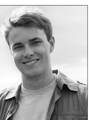
for Judicial Use