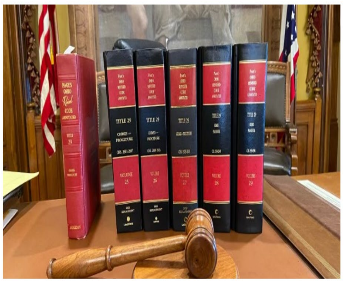
Title 29 of the Ohio Revised Code – one (slim) volume in the early 1990's compared to five (not so slim) volumes today.

Sentencing Roundtable Workgroup DRAFT Report & Recommendations presented to the Ohio Criminal Sentencing Commission December 15, 2022