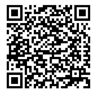
Scan this QR code to place your order online.

The perfect gift for your mentor, supervisor, senior partner, general counsel, CEO or someone you wish would sponsor you!