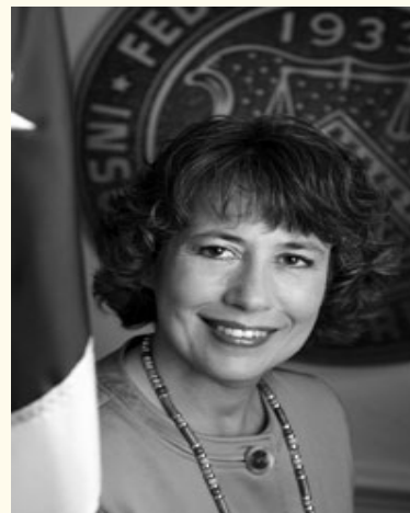
Chairman Sheila C. Bair Federal Deposit Insurance Corporation

I have long supported a systematic and streamlined approach to loan modifications that puts borrowers into affordable, long-term mortgages while achieving an improved return for bankers and investors compared to foreclosure. Using this type of approach, we can help stabilize the U.S. financial markets by minimizing foreclosures on the 6.4 million loans that are currently past due or are projected to become delinquent by mid-2010. Avoiding foreclosure, when it is financially prudent to do so, reduces the downward pressure on the price of nearby homes and helps communities to maintain the services they provide to neighborhoods. Unnecessary foreclosures perpetuate the cycle of financial distress and risk aversion, which potentially could cause housing prices to overcorrect and create even larger losses for both borrowers and the financial industry.