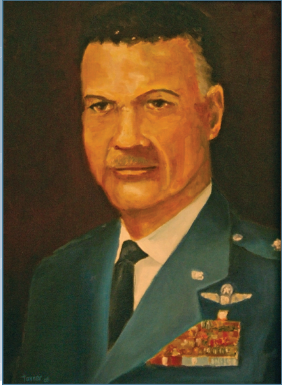
Benjamin O. Davis Jr., 2007, Oil on Canvas.

Benjamin O. Davis Jr. was born Dec. 19, 1912, in Washington, D.C. His father was a lieutenant colonel in a strictly segregated area of the Tuskegee Institute. As a child, Benjamin convinced his father to spend $5 on an airplane ride.