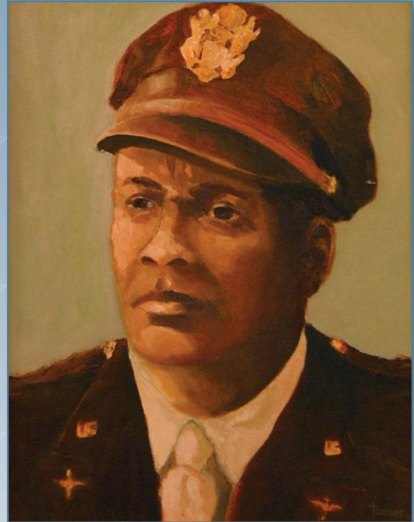
Daniel “Chappie” James Jr., 2007, Oil on Canvas.

James became America’s first black four-star general. His final and most prominent assignment was as commander-in-chief of the North American Air Defense Command and of the U.S. Air Force Aerospace Defense Command.